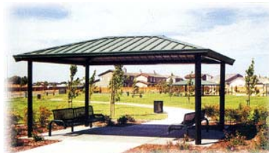
Picture from the catalog of the type of structure planned.